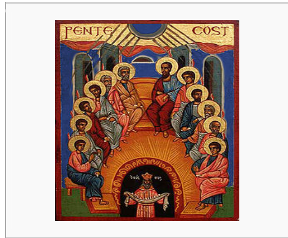
An Eastern Orthodox Christian icon depicting Pentacost, the descent of the Holy Spirit upon the heads of the apostles, fifty days after Easter Sunday.

May 23 – Pentacost Sunday , the 50th Day after Easter, on which the Holy Spirit descended upon the apostles and other followers of Jesus Christ, causing their heads to erupt with flames, as they were taken up with the fervor and spirit of God.